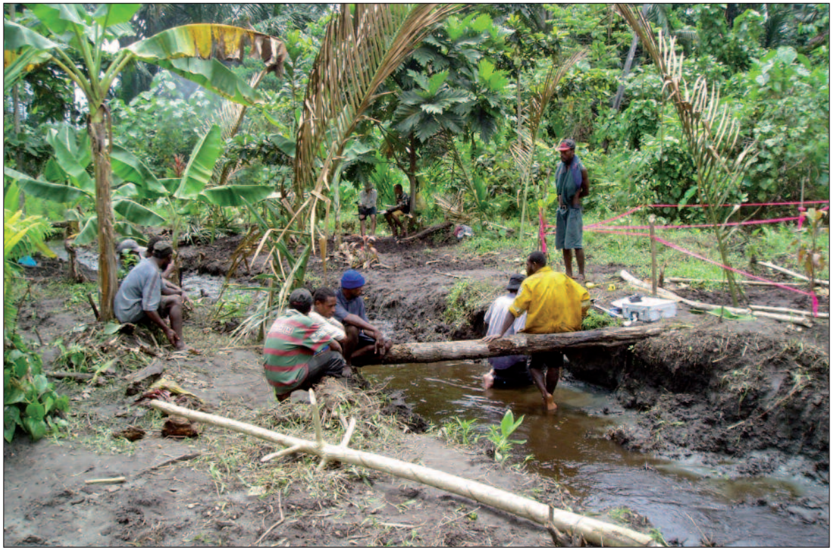
Figure 2. Keveoki 1 Village Site. Excavation in progress at location of magnetometer feature M1.